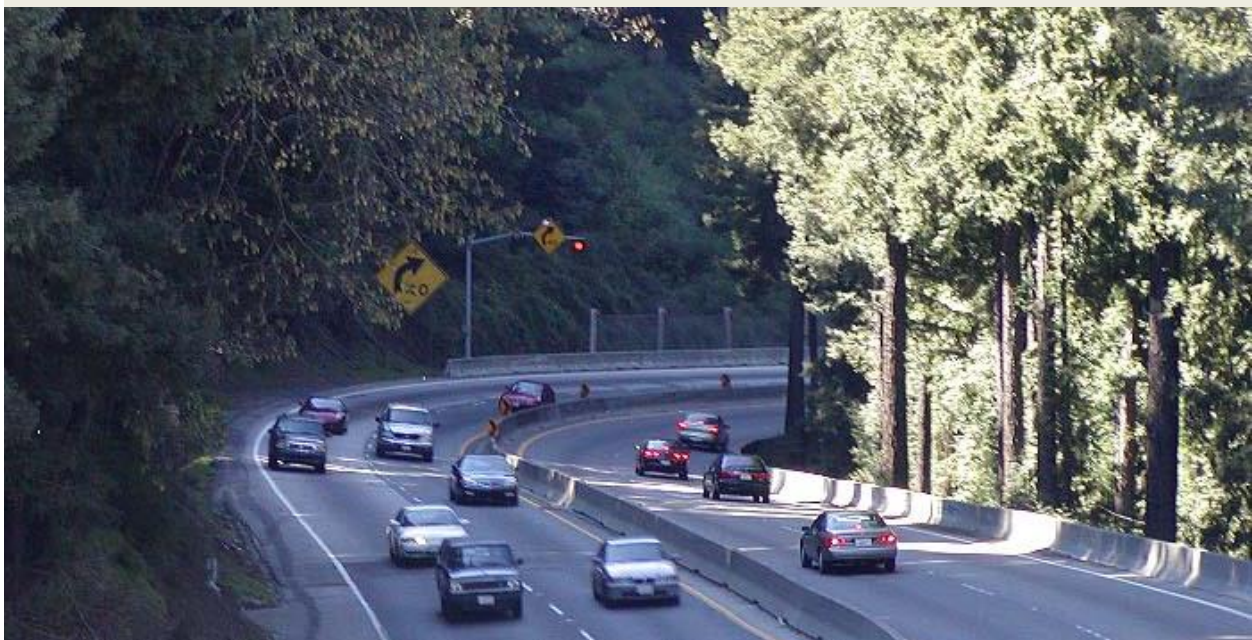
Highway 17

The 10-year, $52 billion funding package enacted in April 2017 by the Legislature and Governor includes $30 million for advanced mitigation strategies like the Highway 17 wildlife corridor, which will not only help safeguard motorists and wild creatures in the Santa Cruz Mountains, but also enable habitat connections elsewhere along California's roads.