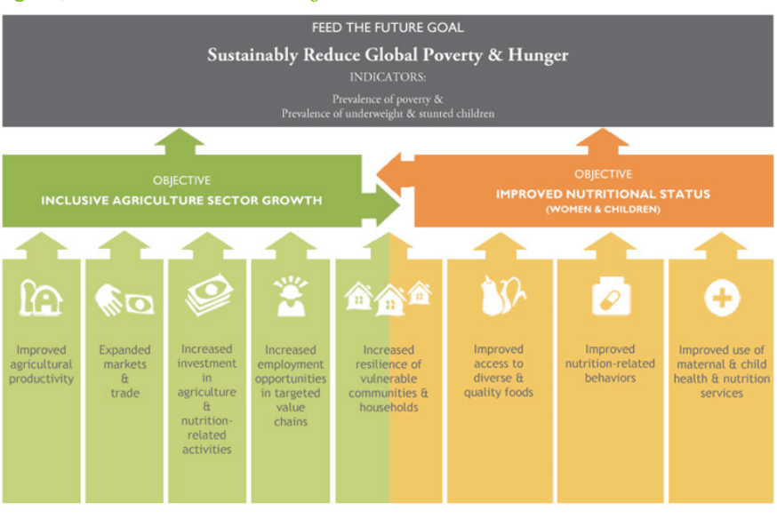
Figure 3 USAID's Feed the Future Logic Model