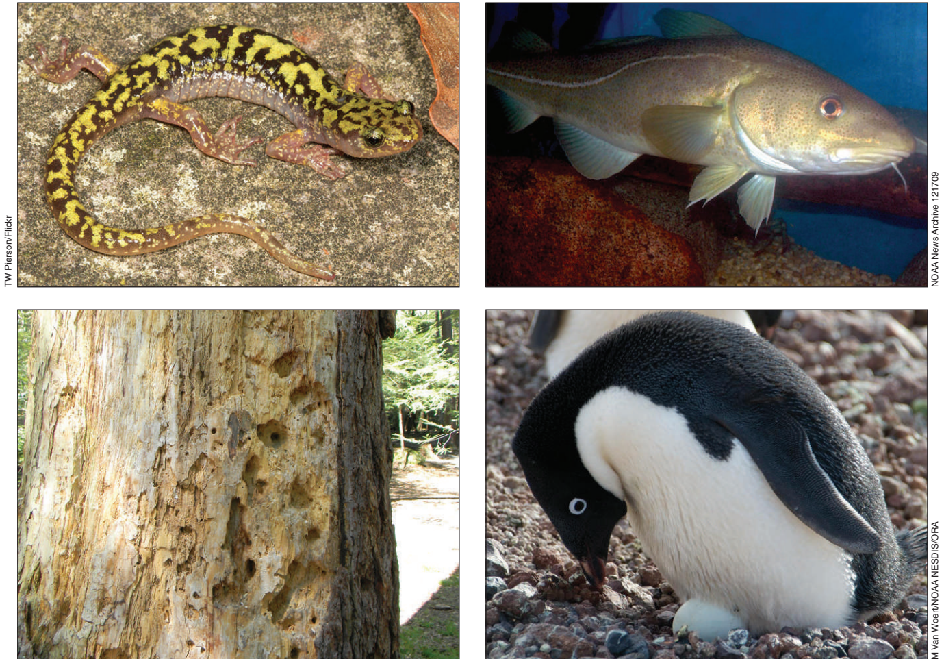
Figure 3. Examples of species for which the interacting effects of climate change and other stressors have been documented. Green salamanders ( Aneides aeneus , upper left) have declined in southern Appalachia due to the combination of warming and habitat fragmentation. Atlantic cod ( Gadus morhua , upper right) in the North Sea, already severely depleted by overfishing, show poorer recruitment during warmer years. Eastern hemlocks ( Tsuga canadensis , bottom left) are experiencing more attacks by the hemlock woolly adelgid, which is typically kept in check by cold winters. Adélie penguins ( Pygoscelis adeliae , bottom right) are continuing to bioaccumulate dichlorodiphenyltrichloroethane (DDT), most likely due to its release by melting glaciers.

could lose more than 22% of fish species by 2070 due to the combined effects of increased water withdrawal and climate change. For three out of the four rivers examined in the US, the combined effects of climate change and water withdrawal were notably greater than the effect of climate change alone (Xenopoulos et al. 2005).