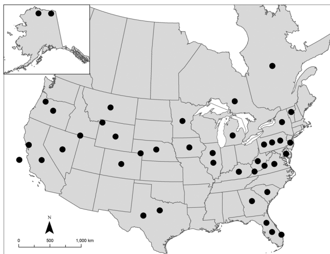
Figure 1. Locations of projects (representing state agencies and natural heritage programs, conservation organizations, and universities) invited to complete a June–September 2013 survey of Climate Change Vulnerability Index users in the United States and Canada. Dots represent approximate centers of each project's assessment area. All invitees, rather than respondents, are indicated to preserve anonymity.

North America representing a diverse set of institutional affiliations, including natural heritage programs (36%), non-profits (28%), state agencies that are not heritage programs (12%), a federal agency (4%), a university (4%), a natural history museum (4%), and a joint natural heritage program and state agency effort (4%). In addition, we found reports of 20 distinct CCVI assessments in the literature (Table 1).