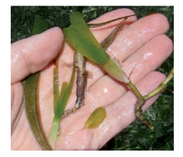
5 seagrass species, left to right: Enhalus acoroides, Cymodocea rotundata, Thalassia hemprichii, Halophila ovalis, and Cymodocea serrulata in Palau .

seagrass shoots vary from long, thin or strap-like leaf blades (up to 3 m long) to small, rounded paddle-shaped leaves (less than 1 cm long). The vegetative growth patterns of lateral branching and new shoot production often create dense meadows that form a canopy over the marine sediment. The plants' structure, as well as the height of the canopy and the extent of the