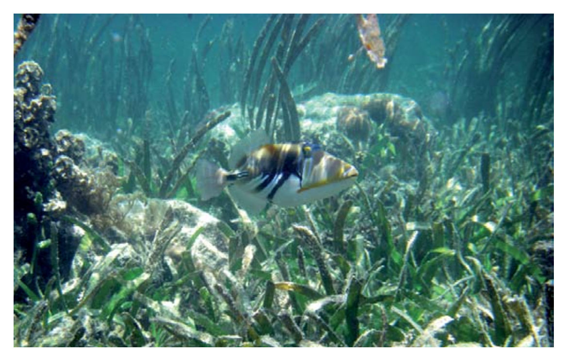
Thalassia hemprichii with Enhalus acoroides in the background, Kosrae, Federated States of Micronesia.

Seagrasses are submerged marine flowering plants forming extensive meadows in many shallow coastal waters worldwide. The leafy shoots of these highly productive plants provide food and shelter for many animals (including commercially important species, e.g. prawns), and their roots and rhizomes are important for oxygenating and stabilising bottom sediments and preventing erosion. The monetary value of seagrass meadows has been estimated at up to $19,000 per hectare per year, thus being one of the highest valued ecosystems on earth.