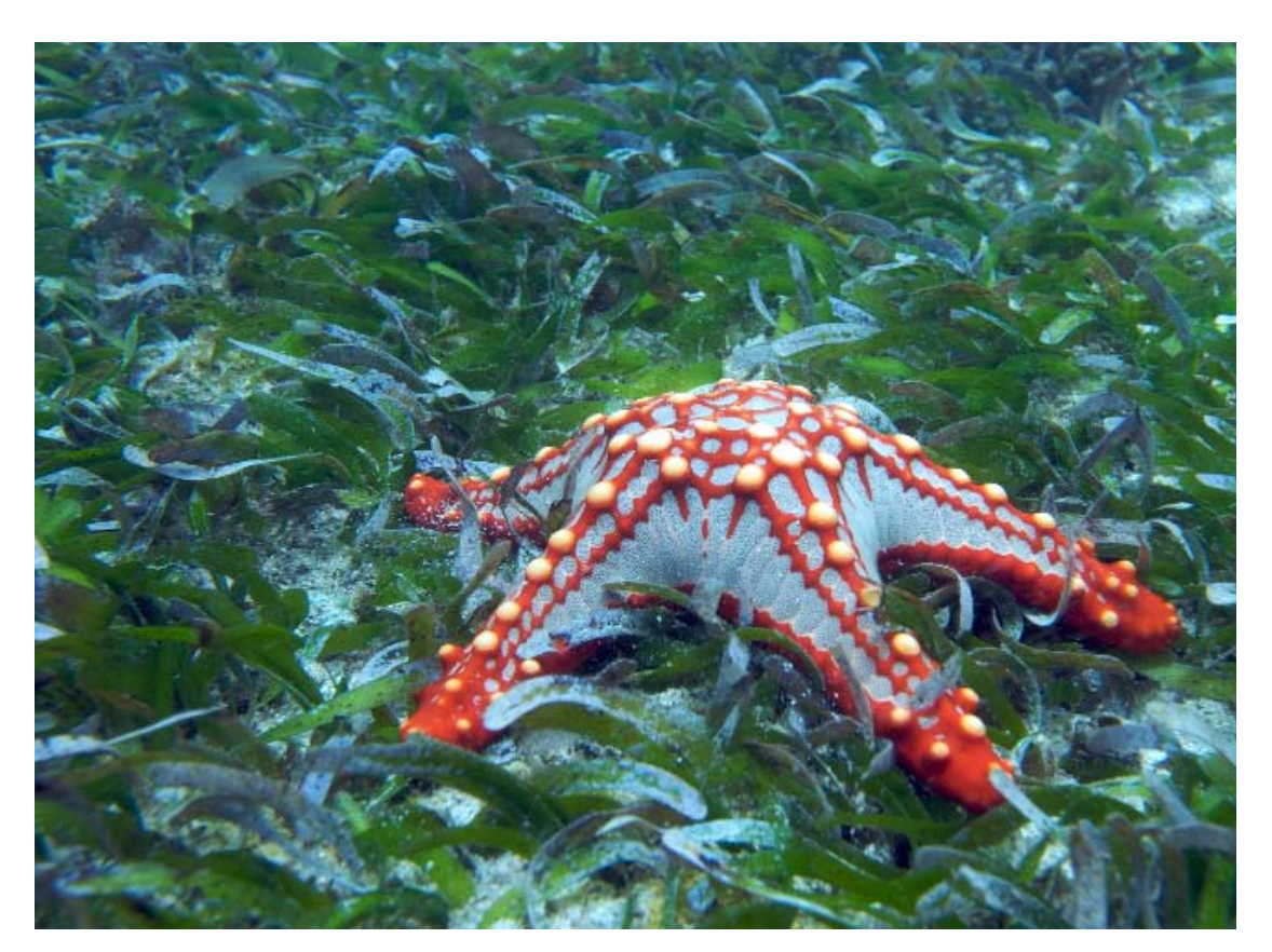
The sea star Protoreaster linckii on the seagrass Thalassia hemprichii on an intertidal reef flat, Tanga, Tanzania.

There is growing evidence that seagrasses are experiencing declines globally due to anthropogenic threats (Short and Wyllie-Echeverria 1996, Duarte 2002, Orth et al. 2006). Runoff of nutrients and sediments that affect water quality is the greatest anthropogenic threat to seagrass meadows, although other stressors include aquaculture, pollution, boating, construction, dredging and landfill activities, and destructive fishing practices. Natural disturbances such as storms and floods can also cause adverse effects. Potential threats from climate change include rising sea levels, changing tidal regimes, UV radiation damage, sediment hypoxia and anoxia, increases in sea tempera-