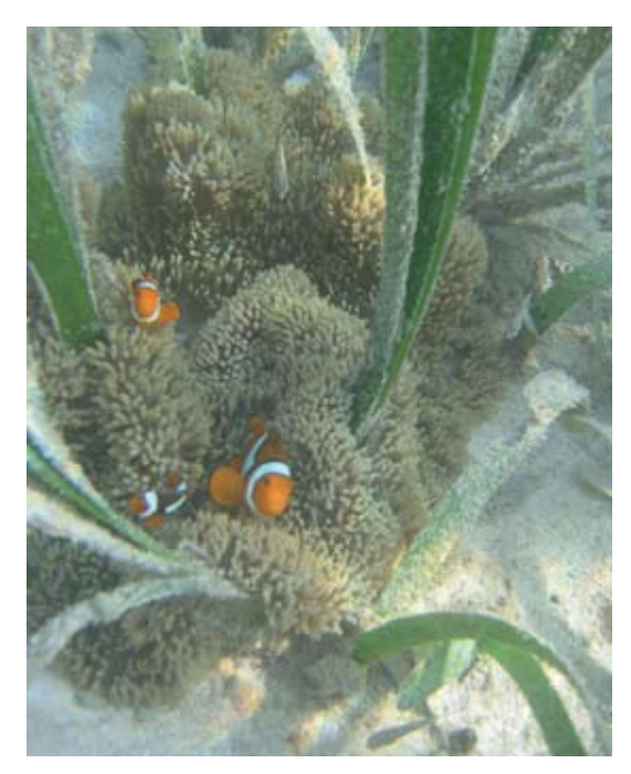
Seagrass, Enhalus acoroides, with sea anemone and clown fish, Kavieng, Papua New Guinea.

Areas where seagrass beds are proven as beneficial to adjacent ecosystems like coral reefs and mangroves should definitely be granted protection. Mangroves, reefs and seagrasses often have a synergistic relationship, based on connectivity, which exerts a stabilising effect on the environment. Seagrasses and mangroves stabilise sediments, slow water movements and trap heavy metals and nutrient rich run-off, thus improving the water quality for corals and fish communities. Seagrasses and mangroves filter freshwater discharges from land, maintaining necessary water clarity for coral reef growth. Coral reefs, in turn, buffer ocean currents and waves to create a suitable environment for seagrasses and mangroves. Mangroves also enhance the biomass of coral reef fish species. It has been shown that seagrass meadows are important intermediate nursery habitats between mangroves and reefs that increase young fish survival (Mumby et al. 2004, Unsworth et al. 2008). Protected area managers