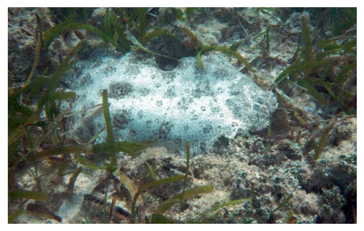
Flatfish in seagrass, Cymodocea rotundata and Thalassia hemprichii, behind the reef flat of a fringing reef of hard substrate mixed with sand, Tanga, Tanzania.

This paper presents an overview of seagrasses, the impacts of climate change and other threats to seagrass habitats, as well as tools and strategies for managers to help support seagrass resilience.