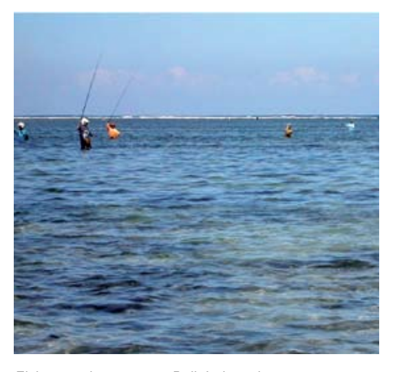
Fishermen in seagrass, Bali, Indonesia.

Seagrasses have had many traditional uses (cf. Terrados and Borum, 2004). They have been used for filling mattresses (with the thought that they attract fewer lice and mites than hay or other terrestrial mattress fillings), roof covering, house insulation and garden fertilisers (after excess salts were washed off). They have also been used in traditional medicine in the Mediterranean (against skin diseases) and in Africa (Torre-Castro and Rönnbäck 2004). Seagrass seeds of several species are sometimes used as a food source.