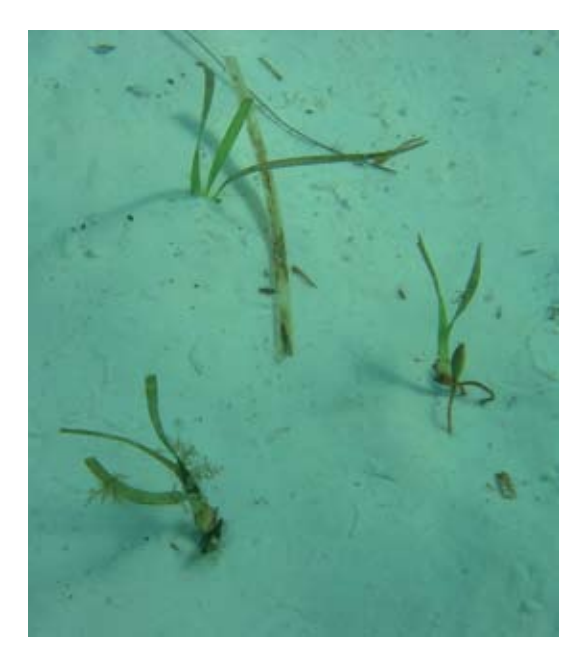
Propagules and seedlings : Posidonia australis in Western Australia.

spp.) to "climax" species that spread slowly and build up large carbon reserves (e.g. Thalassia spp. and Posidonia oceanica ). For Posidonia, extensive rhizome mats, which form under the living meadows, can be over 3000 years old (Mateo et al. 1997).