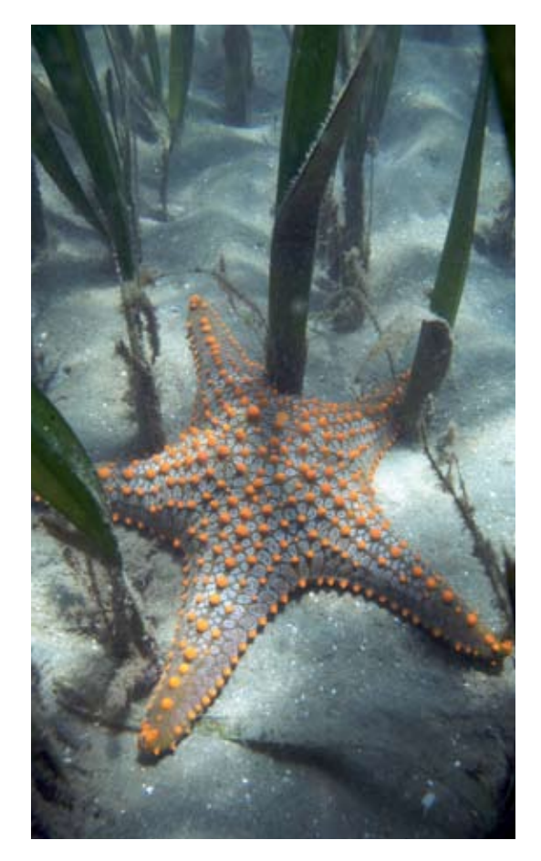
Pentaceraster sp. seastar in Enhalus acoroides meadow, inner near-shore, Tanga, Tanzania.

To effectively reduce the risk of losing seagrasses by climate change impacts and other anthropogenic disturbances, managers should identify and