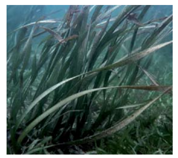
Enhalus acoroides (large) and Thalassia hemprichii (small) in Kosrae, FSM.

cies composition (in mixed meadows). Monitoring of water quality (including light penetration) and sediment composition could be of importance as early warnings of disturbances. Likewise, changes in other biotic factors (e.g. fauna and other plants) may indicate disturbances in the meadows or in the habitats they are connected with.