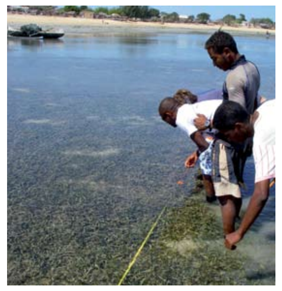
Sampling an intertidal seagrass meadow in Ifaty, Madagascar.

Restoration strategies may help seagrasses to cope with climate change and other anthropogenic impacts and introducing founder populations can speed up ecosystem recovery following a disturbance (Orth et al. 2006b). For example, Halodule wrightii is a pioneering species and has been planted as a habitat stabiliser prior to transplanting Thalassia testudinum and other seagrasses in restoration efforts (Durako et al. 1992, Fonseca et al. 1998).