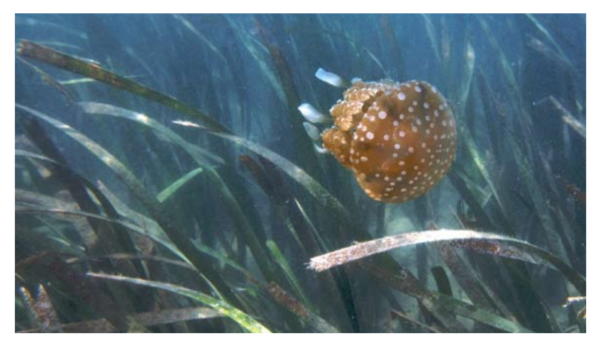
Jellyfish over Enhalus acoroides meadow, inner near-shore, Tanga, Tanzania.

Seagrasses are experiencing a worldwide decline due to a combination of climate change impacts and other anthropogenic factors. Seagrass areas along coastlines that are already affected by human activities (causing e.g. sedimentation, nutrient enrichment, eutrophication and other environmental destruction) are most vulnerable to climate change impacts. Mitigating strategies (e.g. limiting greenhouse gas emissions) that affect the rate and extent of climate change impacts should be coupled with resilience-building adaptation strategies (Johnson and Marshall 2007). Managers can promote policies that protect and conserve seagrasses, while also assisting in mitigation efforts by raising awareness about the vulnerability of seagrass habitats to coastal impacts. Managers can also contribute knowledge about climate change impacts on tropical and temperate marine ecosystems to help set mitigation targets (Johnson and Marshall 2007).