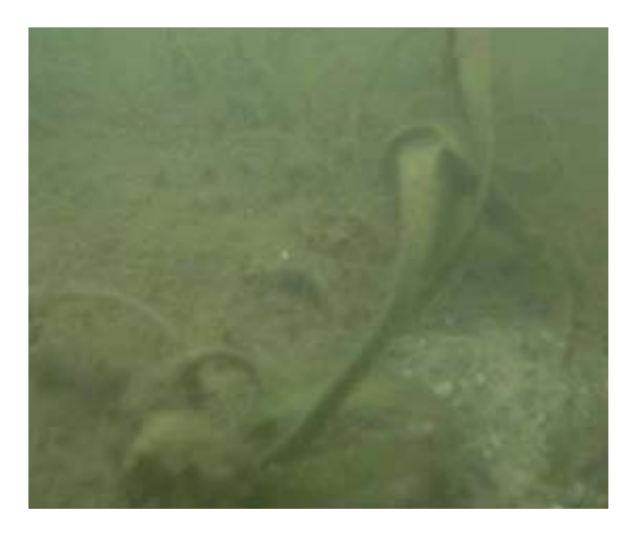
Mourilyan Harbour (Queensland, Australia): Enhalus acoroides is coated with sediment after a heavy rain storm event.

in the normal seawater temperature caused a significant loss in shoot density; however, it seemed that a high genetic diversity within the meadows increased its possibility to recover from such extreme temperatures (Reusch et al. 2005, Ehlers et al. 2008). At the margins of temperate and tropical bioregions (Short et al. 2007), and within tidally restricted embayments where plants are growing at their physiological limits, increased temperature will result in losses of seagrasses and/or shifts in species composition. Seagrass distribution and abundance may also be altered through the effects of increased temperature on flowering and seed germination (de Cock 1981, McMillan 1982, Phillips et al. 1983, Durako and Moffler 1987).