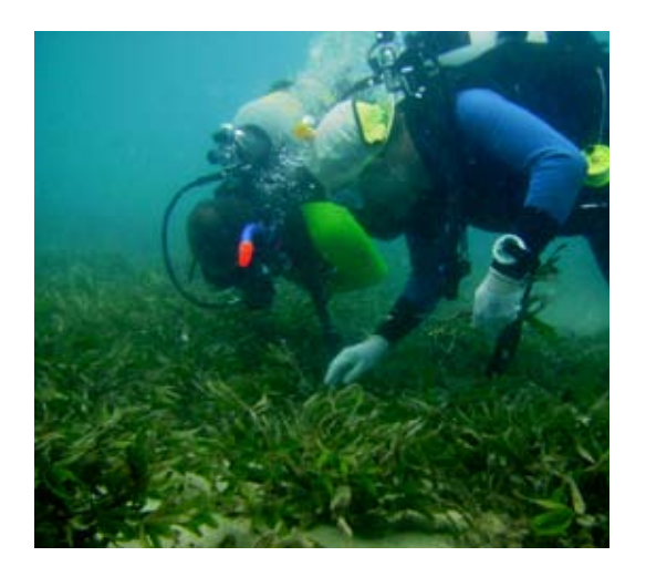
Sampling seagrasses in Madagascar, Thalassodendron ciliatum meadow, Madagascar.

the sediments, which in turn allows nutrients to be efficiently recycled from dead organic matter.