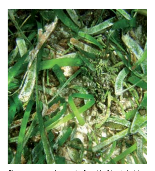
Six seagrass species can be found in this photo taken in Palau: Enhalus acoroides, Cymodocea rotundata, Cymodocea serrulata, Thalassia hemprichii, Syringodium isoetifolium, and Halodule uninervis.

Some seagrasses acclimate to changing environmental conditions better than others. Intra-meadow genetic diversity has been shown to be a key factor supporting the resilience of Zostera marina , and efforts should be devoted to investigating such mechanisms in other key seagrasses.