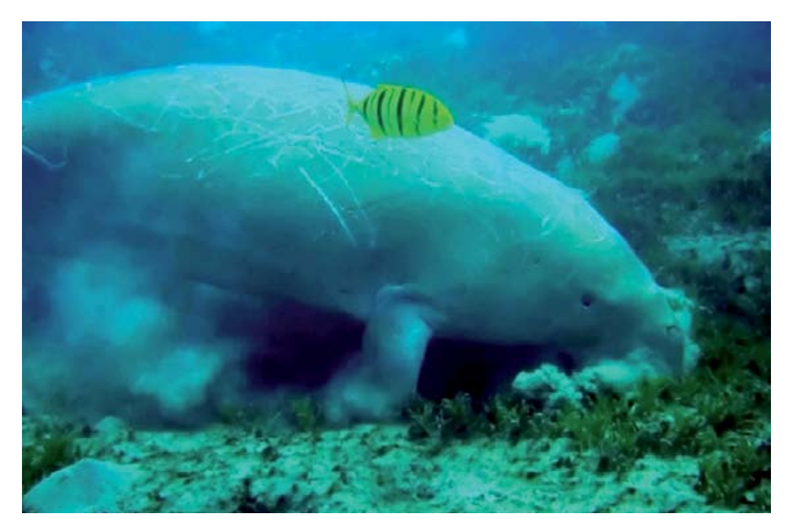
Dugong in seagrass: Halophila stipulacea bed, Red Sea, Egypt

reefs, while in the tropics critical links are with mangrove forests and coral reefs. Seagrasses provide habitats for rich faunal assemblages and seagrass meadows are recruitment and nursery areas for fish and crustaceans (Green and Short 2003). The "seagrass fauna" includes animals at many trophic levels, the most visible herbivores being dugongs, manatees and sea turtles in tropical, and swans and geese in temperate, waters. Seagrasses are also a direct food source for sea urchins and many species of fish (Pollard 1984, Heck and Valentine 1995). However, beyond direct consumption, seagrasses provide crucial food web resources for animals and for people. Particularly important are subsistence gleaning for protein on tropical coasts by villagers, nursery resources for commercially important finfish and shellfish species, and habitats for commercial and recreational bivalve fisheries.