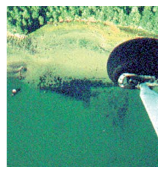
Restored Zostera marina bed from the air, New Hampshire, USA.

Site selection that favours seagrass growth is important (see Fact Box 9, see also Short et al. 2002a and Short and Burdick 2005 for quantitative site selection models). While collecting planting stocks (mature shoots or seeds), care must be taken to minimise damage of the donor meadows. Transplantation is labour intensive because it requires the painstaking harvest of shoots followed by hand or frame transplanting, limiting it applicability for large areas.