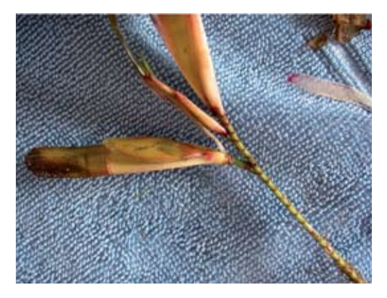
Thalassodendron ciliatum in Mombassa, Kenya: flow ering shoot with viviparous seedling.

must in seagrasses support not only their aboveground tissues but also their underground roots and rhizomes (and the latter can have a biomass exceeding that of the shoots). Thus, seagrasses must in principle photosynthesise more than e.g. macroalgae in order to support the growth of the entire plants. On the other hand, the roots of seagrasses aid them in the uptake of nutrients; thus, seagrasses can thrive in nutrient-poor waters provided that the substrate is rich in nutrients. What, then, is the limiting factor for the growth and productivity of seagrasses as based on their photosynthetic rates? Under natural conditions, light, salinity, the inorganic carbon source, nutrient availability and temperature can all limit the growth rates of seagrasses.