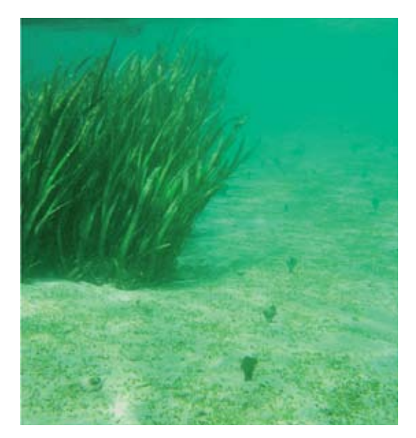
Seagrass diversity: Enhalus acoroides (large) and Halophila ovalis (very small) in Guam.

Sea level rise and altered currents: With future global warming, there may be a 1-5 m rise in the seawater levels by 2100 (taking into account the thermal expansion of ocean water and melting of ocean glaciers, Overpeck et al. 2006, Hansen 2007, Rahmstorf 2007). Rising sea levels may adversely impact seagrass communities due to increases in water depths above present meadows (thereby reducing light), changed currents causing erosion and increased turbidity and seawater intrusions higher up on land or into estuaries and rivers (favouring land-ward seagrass colonisations, Short et al. 2001). Changing current patterns can either erode seagrass beds ("beds" are often used in this text synonymously to "meadows", but may indicate comparatively smaller entities) or create new areas for seagrass colonization. On the positive side, increases in current velocity within limits may cause increases in plant productivity (see Fact Box 9) reflected in leaf biomass, leaf width, and canopy height (Conover 1968; Fonseca and Kenworthy 1987, Short 1987).