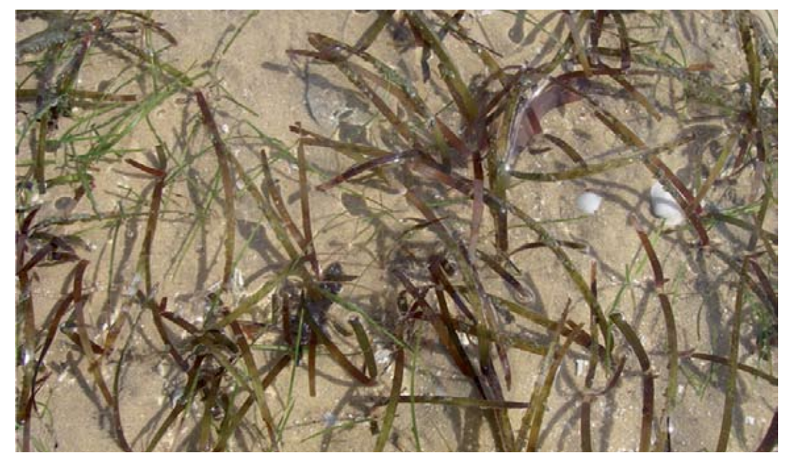
Cymodocea rotondata with red leaves from UV blocking pigments, Hainan Island, China.

pard and Rioja-Nieto 2005). Temperature stress on seagrasses will result in distribution shifts, changes in patterns of sexual reproduction, altered seagrass growth rates, metabolism, and changes in their carbon balance (Short et al. 2001, Short and Neckles 1999). When temperatures reach the upper thermal limit for individual species, the reduced productivity will cause plants to die (Coles et al. 2004). Elevated temperatures may increase the growth of competitive algae and epiphytes, which can overgrow seagrasses and reduce the available sunlight they need to survive. The response of seagrasses to increased water temperatures will depend on the thermal tolerance of the different species and their optimum temperature for photosynthesis, respiration and growth (Neckles and Short 1999). For tropical seagrasses, it was suggested that the photosynthetic mechanism becomes damaged at temperatures of 40-45°C (Campbell et al. 2005). High temperatures have likely caused large scale diebacks of Amphibolis antarctica and Zostera spp. in southern Australia (Seddon et al. 2000). For the temperate Zostera marina, experiments showed that a 5°C increase