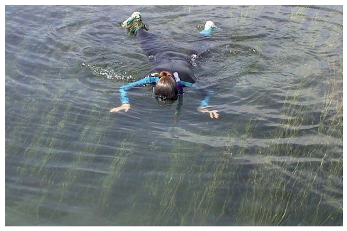
Graduate student snorkeling over a New Hampshire Zostera marina bed.

While only a few larger animals possess the ability to actually digest seagrass leaves (dugongs, turtles, geese, brant, and some herbivorous fish), the leaves often harbour a multitude of organisms such as algae and invertebrates, which serve as food for transient fish, as well as the permanent fauna within the seagrass meadow. Seagrass habitats also provide shelter and attract numerous species of breeding animals. Fish use the seagrass shoots as a protective nursery where they, and their fry, hide from predators. Likewise, commercially important prawns settle in the seagrass meadows at their post-larval stage and remain there until they become adults (Watson et al. 1993). Moreover, adult fish migrate from adjacent habitats, like coral reefs and mangrove areas, to the seagrass meadows to feed on the rich food sources within the seagrass meadows (Unsworth et al. 2008). Many small subsistence fishing practices, such as those in Zanzibar (Tanzania), are totally dependent on seagrass meadows for their fishing grounds (Torre-Castro and Rönnbäck 2004); coastal popu-