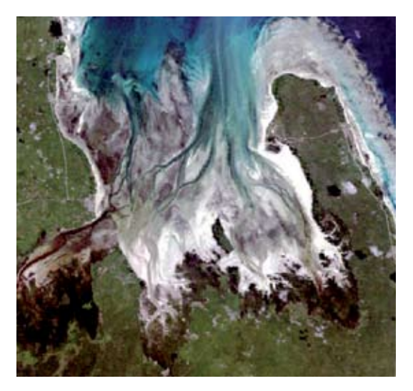
Satellite image of Chwaka Bay, Zanzibar, Tanzania.

seagrass beds (Gullström et al. 2006). It should be remembered that extensive ground-truthing is necessary for verifying all remote mapping data (Duarte and Kirkman 2001).