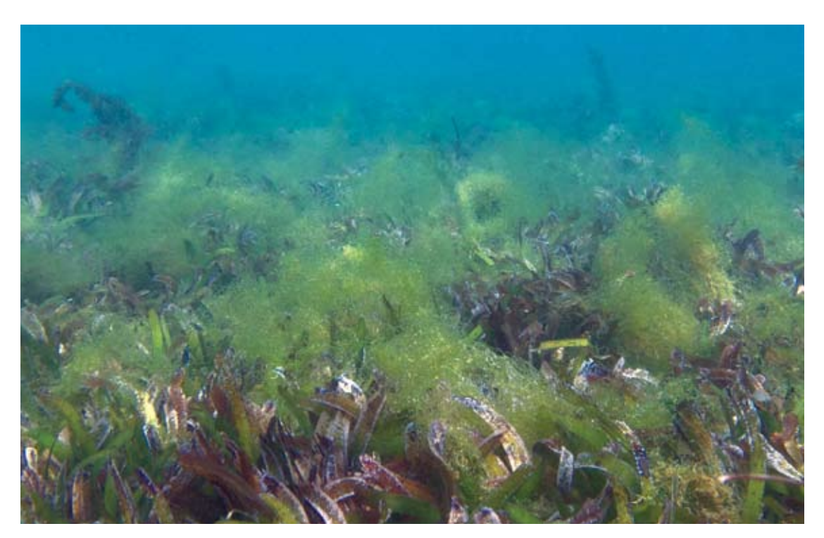
Seagrass bed, Thalassia hemprichii, covered with green algae, Tanga, Tanzania. Fast-growing algae can smother seagrasses as well as corals.

Human development can alter coastal ecology, often resulting in loss of seagrass habitats. Extensive losses, especially in developed and densely populated areas have been documented. An estimated 65% of Zostera marina in industrial parts of the northwest Atlantic was lost since the time of European settlement (Short and Short 2003). In other examples, 5000 hectares of seagrass meadows disappeared during the development of the rural area of Adelaide, Australia (Westphalen et al. 2004) and 58% was lost along the Swedish west coast over the last two decades (Baden et al. 2003).